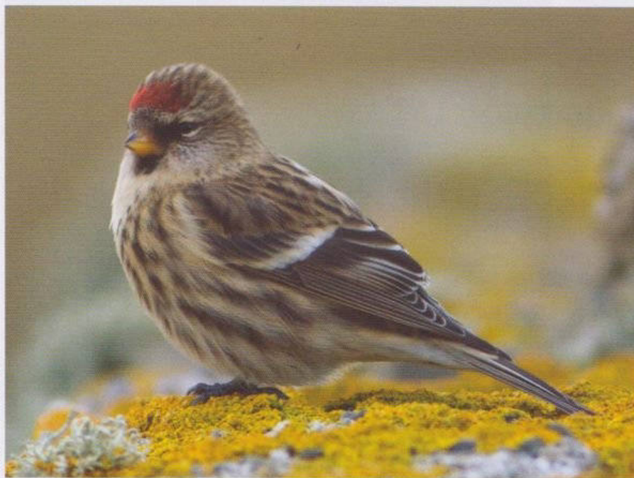
435. Greenland/Dark Iceland Redpoll, Fair Isle, October 2012. This bird is typically sturdy-looking, large-billed, long-winged and long-tailed. The plumage is dark, recalling cabaret , with earth-brown tones to the face and upperparts and, most strikingly, heavily sullied flanks with long lines of thick, blurry streaking extending to the rear. The greater-covert wing-bar on this individual is whitish, though on others it can be more buff.

Many adult males in breeding plumage show no red in the underparts, and those which do show colour may have just a pale wash on the breast.