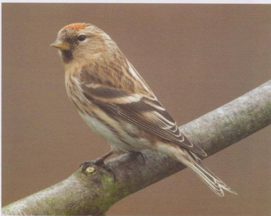
426. Lesser Redpoll, Norfolk, February 2009. This individual is a brighter buff or yellowy-brown in the face and upperparts, and shows white mantle tramlines. However, there is still extensive buff in the wing-bars and wing-feather fringes. The belly is white, contrasting strongly with the warm buff face, upper breast and flanks, the last overlain with prominent dark streaking, which extends to the rear.