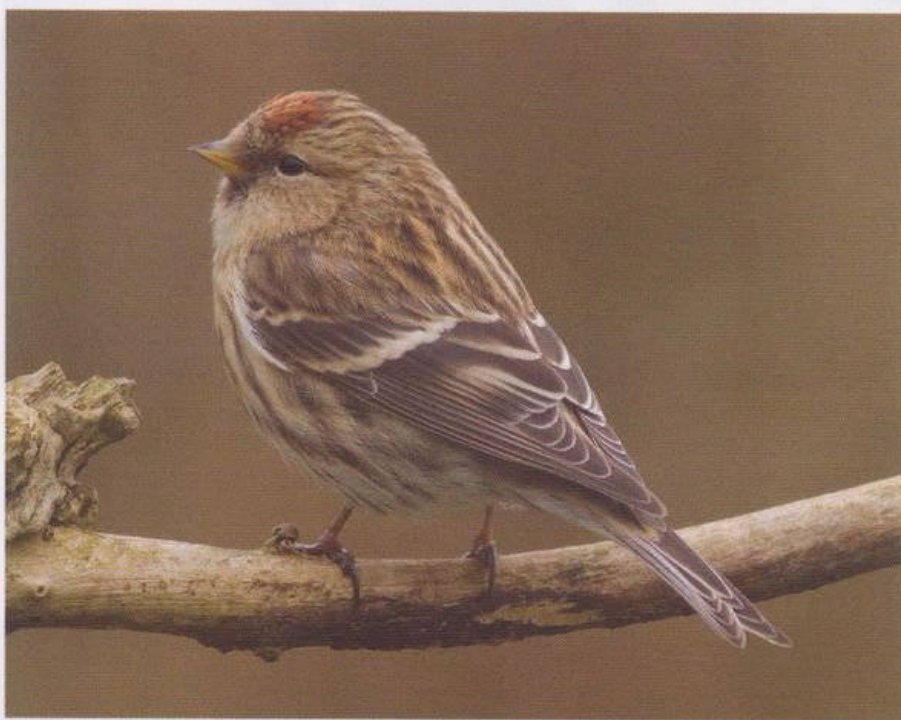
425. Lesser Redpoll, Cambridgeshire, March 2009. This cabaret looks typically neat and compact. The plumage is dark, heavily streaked and strongly suffused with warm brown; the nape is dark, not contrasting with the mantle; there are no obvious white mantle tramlines; and the wing-bars and the fringes to the wing feathers are washed with buff.

Worn, grey-looking spring birds, particularly those with white central mantle 'tramlines' and white greater-covert wing-bars, may be distinguishable from some flammea only with difficulty, while cabaret and rostrata /dark islandica share dark and warm plumage tones and may also hardly differ in plumage.