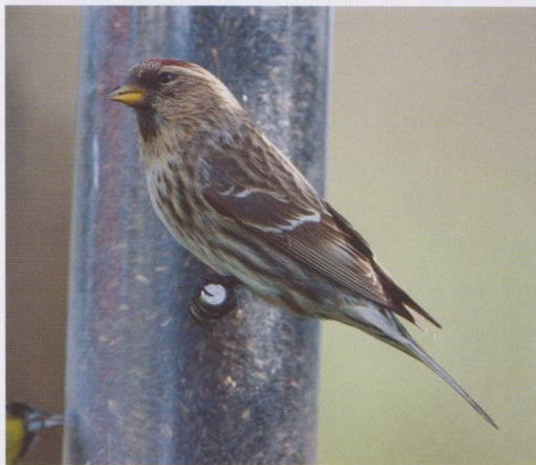
436. Greenland/Dark Iceland Redpoll, Norfolk, March 2009. This bird is one of the very few so far recorded in England. It was clearly a large-looking redpoll in the field, and its identity was confirmed in the hand. Note the long-bodied appearance as well as strikingly long wings and tail. The bill is large and the culmen subtly convex. Most obvious, however, is the very heavy flank streaking, which continues to the rear to join up with broad, dark arrowhead markings on the undertail-coverts. In life, this bird was strongly grey-toned, typical for a spring bird, yet note also the deep buff wash to the face and throat.