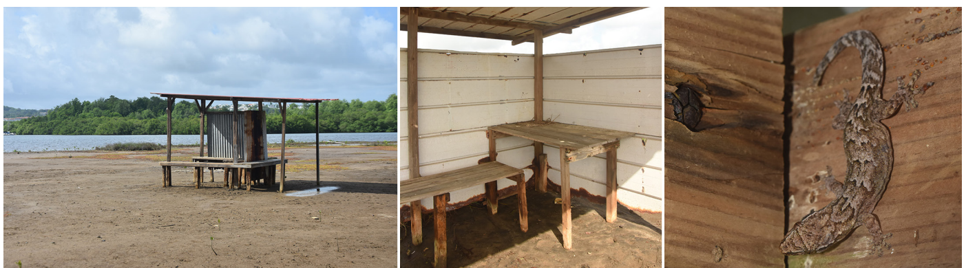
Fig. 3. A hunting shed near the mouth of the Lézarde River on Martinique where Mourning Geckos ( Lepidodactylus lugubris ) were observed.